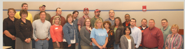
AIDT Spring Class