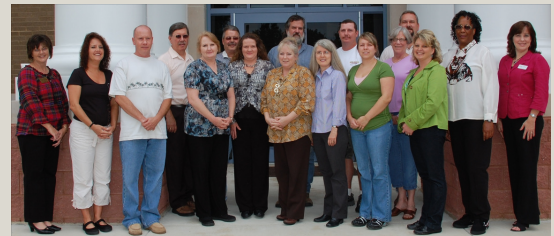
AIDT Fall Class

We will host another class in the spring. If you are interested in attending, please contact us at 256-574-1331 or e-mail shepard@scottsboro.org .