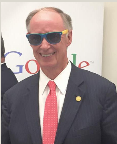
Governor Robert Bentley sports his Google sunglasses following the announcement.

Google anticipates starting construction in 2016. The data center will employ up to 100 people in a variety of full-time and contractor roles, including computer technicians, engineers, various food services, HVAC, maintenance, and security roles. For more information, visit www.google.com/jacksoncounty .